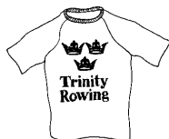
SUNSMART TRAINING SHIRT $34.45