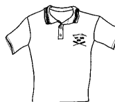
Regatta Shirt $30.00