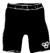
Rowing Shorts $38.50

Dress uniformity is CRITICAL to all crews LABEL ALL CLOTHING BOLDLY