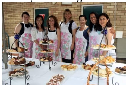
TC parents provided a wonderful Morning Tea