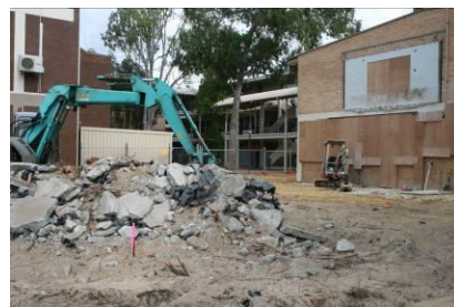
After: Tuesday, 17 November 2009