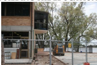
Before work commenced: Tuesday, 10 November 2009

The new building will include the extension of the current Senior Library area, ablutions for male and female, Science Faculty room, Archive room, Interview Office space and three classrooms.